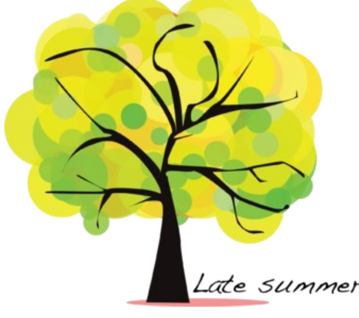
August - September 2018